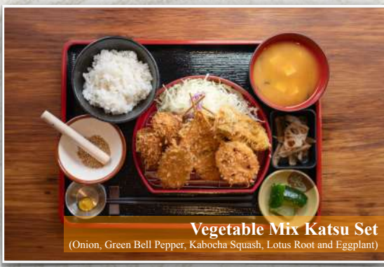
Vegetable Mix Katsu Set (Onion, Green Bell Pepper, Kabocha Squash, Lotus Root and Eggplant)

野菜フライ定食 (玉ねぎ、ピーマン、カボチャ、レンコン、茄子) .....$22.00