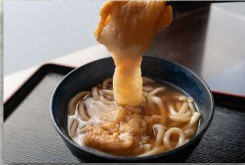
Mochi Udon (Rice Cake Wrapped in Fried Tofu) /餅巾着うどん …… $12.00