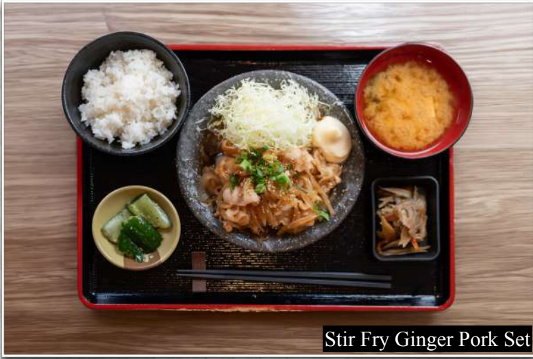
Stir Fry Ginger Pork Set