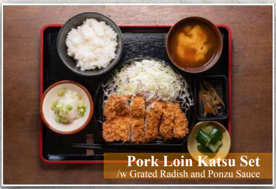
Pork Loin Katsu Set /w Grated Radish and Ponzu Sauce

野菜フライ定食 (玉ねぎ、ピーマン、カボチャ、レンコン、茄子) .....$22.00