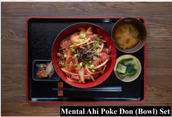
Mental Ahi Poke Don (Bowl) Set