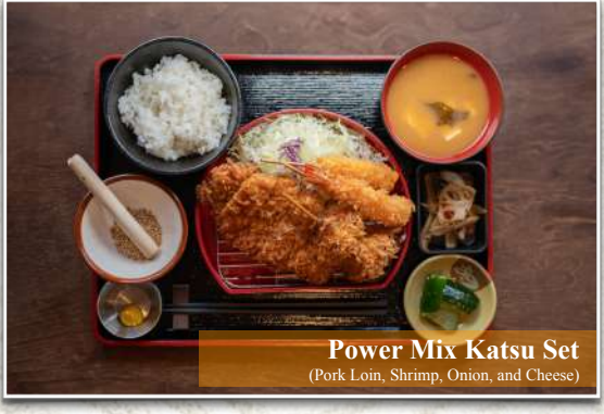
Power Mix Katsu Set (Pork Loin, Shrimp, Onion, and Cheese)

海鮮フライ定食 (エビ、サーモン、ソフトシェルクラブ、ホタテ、オイスター) .....$25.00