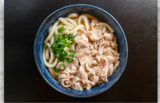
Pork Belly Udon /肉うどん …… $12.00