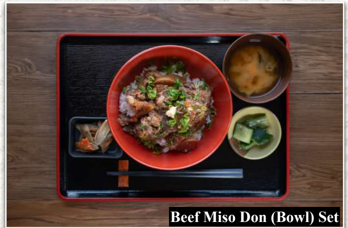
Beef Miso Don (Bowl) Set