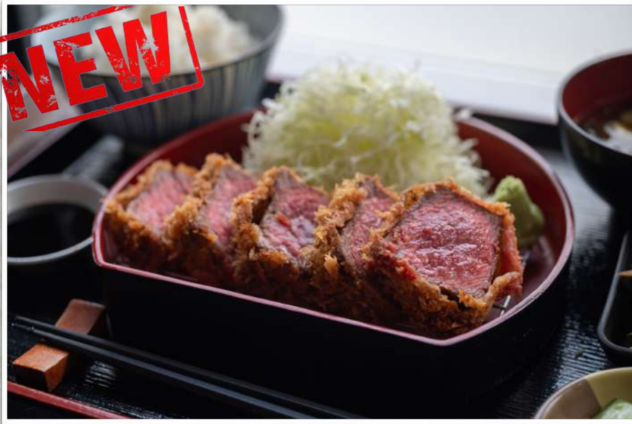
BEEF KATSU SET 牛カツ定食 .....$32.00