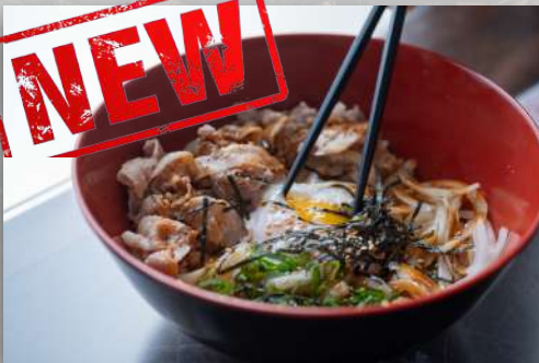
Maze Soba Soupless Udon /まぜそば風うどん …… $14.00