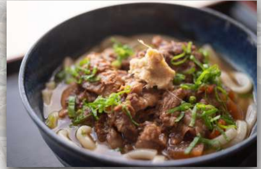
Beef Miso Udon /牛味噌煮込みうどん …… $14.00