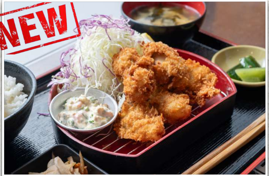
OYSTER KATSU SET 牡蠣フライ定食 .....$25.00