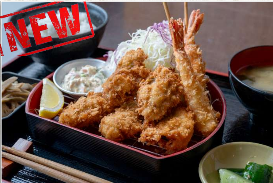
OYSTER & SHRIMP KATSU SET 牡蠣フライ・海老フライ定食 .....$30.00