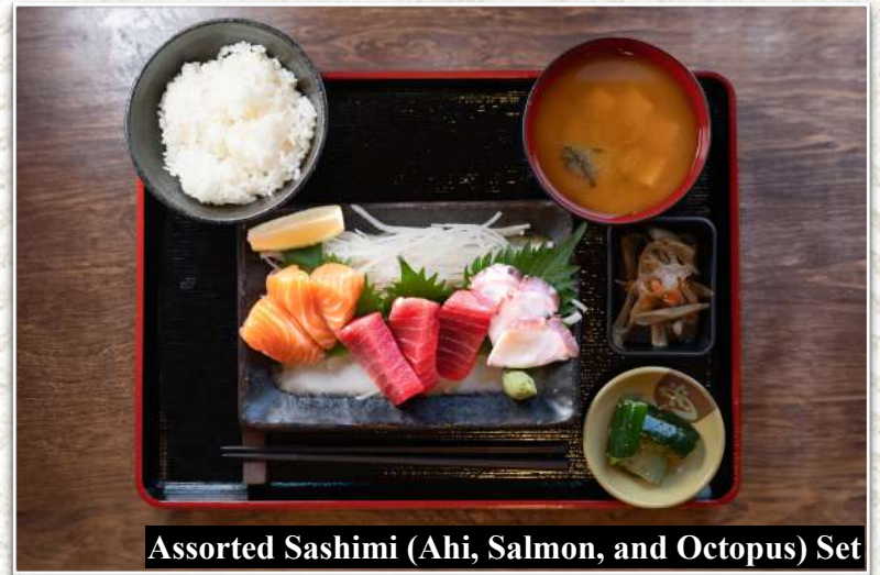
Assorted Sashimi (Ahi, Salmon, and Octopus) Set