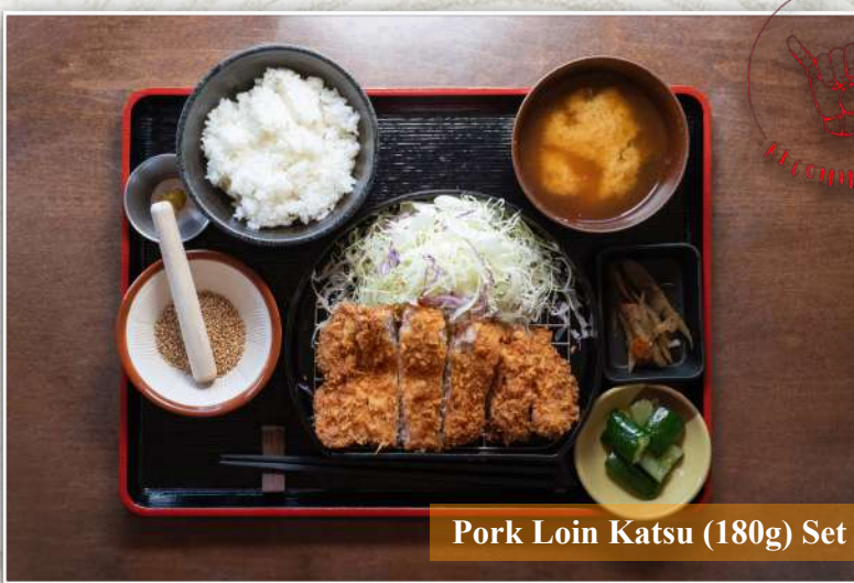
Pork Loin Katsu (180g) Set

パワーミックスフライ定食 (ロースカツ、エビ、玉ねぎ、チーズ) .....$30.00