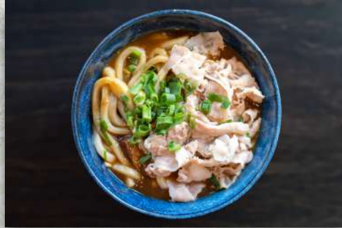
Curry Udon /カレーうどん …… $13.50