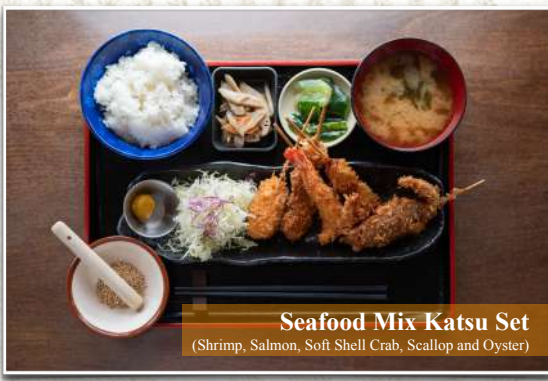
Seafood Mix Katsu Set (Shrimp, Salmon, Soft Shell Crab, Scallop and Oyster)

*Set meals include Rice, Miso Soup, Pickled Cucumber, and Kimpira Gobo